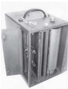
Figure 3. Side door opens to assist photographer when inserting film. Note adjustable slot knob on top and 120 film spool in place.

top. The Rochester camera (Model I) was the only No. 10 Cirkut built that had an adjustable exposure slot of 1/8", 1/4" or 1/2" (Figure 3). This model used air-resistance fans of different sizes to control the speed of camera rotation on the tripod. The five fans that came with the camera gave exposure times (equivalent shutter speeds) of 1/3, 1/6, 1/10, 1/25 and 1/30 of a second using the 1/4" exposure slot. If the 1/8" exposure slot was used, the exposure time was half of the time of the particular fan selected. If the 1/2" exposure slot was used, the exposure time was double the time of the particular fan selected.