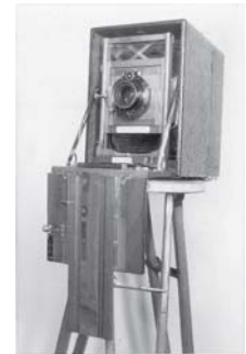
Figure 5. Model I with 6" auxiliary bed in place.