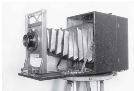
Figure 1. The first No. 10 Cirkut manufactured by Rochester Panorama. Note scissors mechanism to raise or lower the lensboard, which identifies it as an earlier fan type (Model I or II).

The Cirkut Camera probably obtained its name from photographing military units. In the early days, a photographer made a circuit of the area to take photographs of tents and troop maneuvers. The