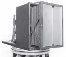
Figure 4. Ground glass in position for focusing, shown folded back and hinged over prior to film box placed on camera body.

Camera, the film box is removed, and the ground glass focusing back is pulled out and locked in place (Figure 4). This is the way all No. 10 Cirkuts are focused.