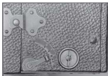
Figure 8. Start-stop and speed selector levers on governor type cameras.

speed control fans were eliminated, and a variable speed internal governor was added to the camera clockwork. The new camera speeds made available on the Model V were: 1/12, 1/10, 1/9, 1/8, 1/4 and 1/2 of a second. A lever on the side of the camera film box (Figure 8) is rotated to start and stop, and, at the same time, the lever opened and closed the exposure slot. The exposing slot was fixed at ¼", and the film spool bracket adjustment was for