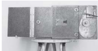
Figure 2. Bottom view, showing three rollers, tripod gear and tripod gear. Hinge on left for tilting front bed.

The lensboard for this first Cirkut No. 10 was 3¾" square. The lens could be tilted and/or raised up or down, with an adjustable screw on top of the camera lens frame. This camera had three rollers on the bottom of the camera (Figure 2) for camera rotation on the brass ring-gear on the wood tripod