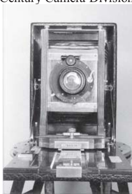
Figure 6. Newly designed lens frame by Locke used on Model III and IV.

the Model III. The camera's wood lens frame was revised (Figure 6), as the lensboard tilt movement on the Models I and II was replaced with a right or left front adjustment. The up and down vertical movements of the lens were retained, and the lensboard size was changed to 3½" square. The brass base plate for the mechanical motor was made rectangular (4¼" x 7¼"), as compared to the oval shaped plate designed by the Rochester Panoramic Company.